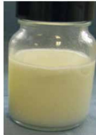
ROTOWASH BIO-125 after 60 minutes