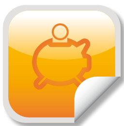
Reduced production cost

By using ROTOWASH BIO-125 which offers optimised cleaning power to remove ink and paper in a short time, the cleaning process is handled in a short time by which down-time is minimized. Moreover due to the spontaneous and stable emulsification the printer can restart immediately with a dry blanket. This leads to a reduction in paper waste which has an immediate effect on the costs.