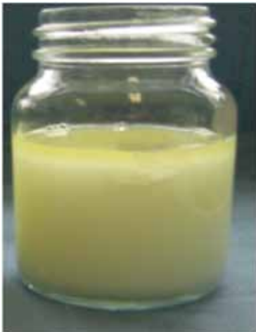
ROTOWASH BIO-125 just mixed with water

As the ROTOWASH BIO-125 has a higher flashpoint, >100^{\circ}\text{C} (to reduce harmful VOC's), the wash is naturally slow to evaporate. This means that wash can still be present on the blanket during a press restart and may result in unnecessary waste copies. As the wash is removed from the blanket with water, an emulsifier is added to our ROTOWASH BIO-125 to give a "spontaneous" (immediately-forming) and stable emulsion to ensure a dry blanket after cleaning. This leads to a reduction in costs.