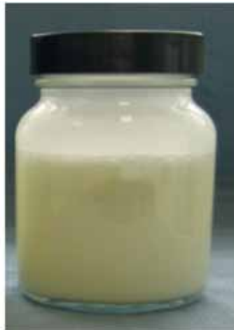
ROTOWASH BIO-125 immediately after shaking