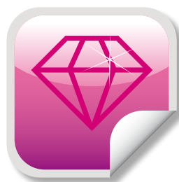
Excellent print quality

Short downtime, quick restart and paper waste reduction also have a positive and direct effect on increased productivity.